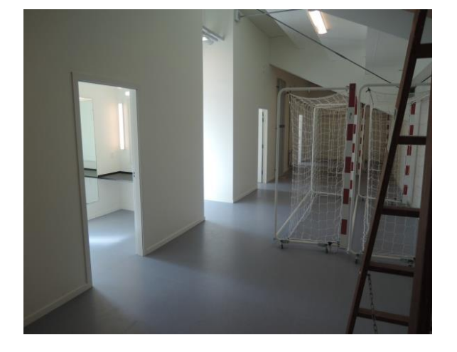
Doping control room and wheelchair storage